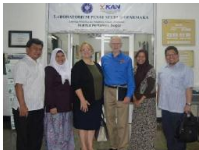
Kunjungan Tamu dari Missouri University, USA